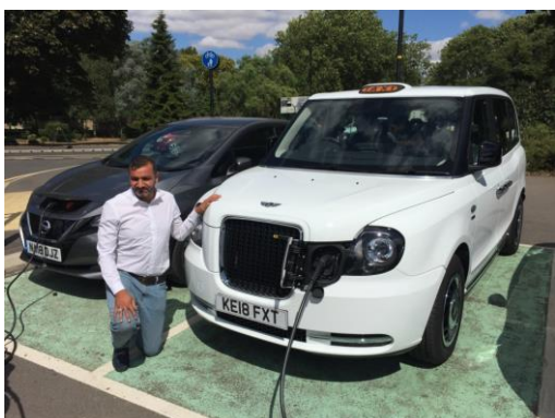
Image: Electric taxi charging in Peterborough.

4.28 Electric vehicles are of critical importance to the region and the country. Between September 2016 and September 2017, the city saw the biggest increase in electric vehicles anywhere in the country (rising by 52 per cent from 5,425 to 8,249). It is important that this growth continues and we need further joint working to understand how we can roll out the infrastructure needed to support this change. We would encourage the Combined Authority to undertake some feasibility work on what infrastructure is needed and how this can be rolled out, looking at initiatives for on-street residential parking, further taxi infrastructure (Peterborough recently secured Government funding to install four rapid chargers for taxis) and buses amongst other considerations such as the energy requirements for the region. We are of the same opinion as Cambridgeshire in that the LTP should seize the opportunity to state an aim for the region to have a world class network of electric vehicles and charging infrastructure.