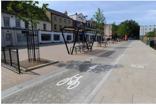
Image: Cycle lane in Lower Bridge Street.