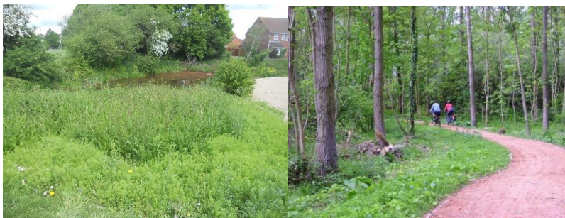
Images: Botolph Green pond and a section of the Green Wheel in Hampton.

We welcome the inclusion of metrics for environmental net gain. This should be developed in consultation with Natural Cambridgeshire Local Nature Partnership, local government officers, statutory bodies and nature conservation organisations (e.g. Wildlife Trust). Local natural capital investment planning should be undertaken to identify the most effective way to deliver appropriate environmental net gain across the region and individual projects.