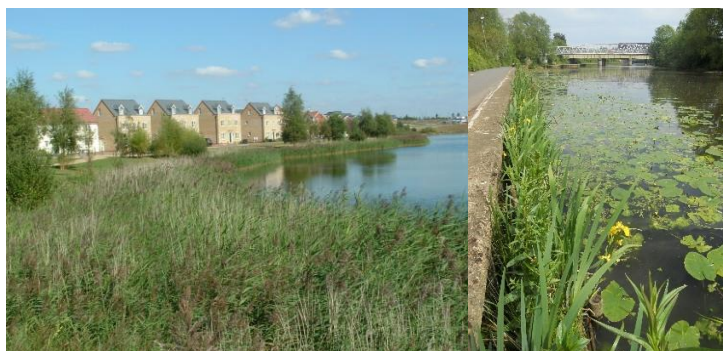
Image: Hampton Lake and the River Nene.