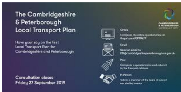
Image: One of the consultation materials produced by the Combined Authority.

The LTP will be the blueprint which shapes the future of transport decisions for years to come. Therefore, it is important that local Members and the general public have ample opportunity to input into this process and having a 3 month consultation period will achieve this. The Council believes that engagement with Members has been effective, two all Member briefings have occurred with a further one planned on 26 September. In addition, the Combined Authority has agreed to present to the Council's Air Quality Task and Finish Group on air quality policies within the LTP. There have been three public consultation events in Peterborough with a fourth planned on 7 September. These have been welcomed but have not been very well attended despite local publicity and direct contact with key local groups. For future consultations we recommend that consideration is given to more innovative engagement methods to get greater participation from the public and special interest groups.