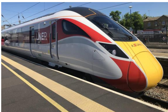
Image: A new Azuma train.

of Peterborough get the services they deserve. A key target, which is mentioned in the LTP, is to have journey times from Peterborough to London in under 40 minutes and this could have a truly transformative impact on the attractiveness of Peterborough as a place for businesses to settle and for people to live.